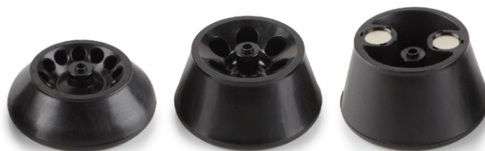
1.5/2.0 mL Tube Rotor